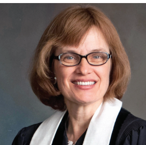
Bishop Debra Wallace- Padgett