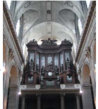
Saint Sulpice -Paris

Day 3- Paris: After enjoying a hot buffet breakfast, your group will embark on a tour of the city. Visit Saint Sulpice Cathedral, the second largest church in Paris and home to the 15,836-pipe organ by Aristide Cavaille- Coll. This famous organ is one of only 3 "100-stop" organs in Europe and has been maintained today almost exactly as it was finished in 1862. As you continue on through the heart of Paris, enjoy a stop at the Eiffel Tower and admire the views of the city. Later, visit the Church of St. Eustache which was built in the 16th century. Long noted for its beauty and charm, this Gothic gem boasts an impressive history of admirers, such as Mozart who chose the sanctuary as the location of his mother's funeral. Also, you will find the new, Van den Heuvel Brothers Organ located here. Return to your hotel for a lovely 3-course meal and overnight.