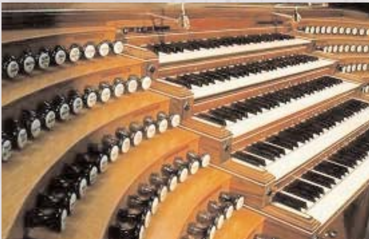
Church of St. Eustache - Paris

Many of David Ott's works are now available on compact disc. They are noted for their structural integrity and lyricism