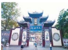
FENGDU GHOST CITY

DAY 07: THREE GORGES DAM After breakfast, enjoy your excursion to the Three Gorges Dam. Upon returning to the ship, set sail as you pass through the gigantic locks on your way through the first of the three large Gorges - the Xiling Gorge. Captain's Welcome cocktail.(B, L, D)