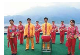
ENTERTAINMENT ON BOARD EMPRESS

DAY 12: XIAN - GUILIN Fly to Guilin in the morning, where upon arrival you will visit Elephant Trunk before checking into your first class hotel for dinner and overnight. (B, D)