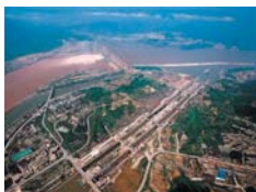
THREE GORGES DAM

DAY 05: BEIJING Today we head to the old Hutong District of Beijing where you will enjoy a rickshaw-ride which will take you to visit a local Chinese family who will cook and share their lunch with you. After that pay a visit to the Silk Market. The rest of the day is at leisure and dinner is on your own. Optional Summer Palace and evening Folk Dance Dinner Show available. ($65pp) (B, L)