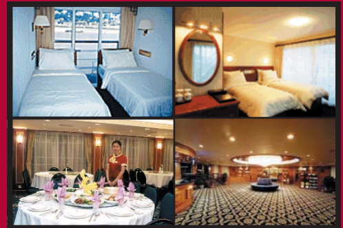
Photos are representation only and may be different to exact cabins and ship design

Along with Beijing, Xian and our deluxe 5 day Yangtze Cruise on board the MS Century Diamond, this program also includes 2 nights in Guilin featuring a sailing down the mystical Li River and 2 nights in Hong Kong. With its neon lights and shopping, the former British colony completes this truly "Best of China" adventure.