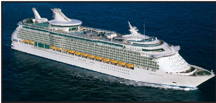
Royal Caribbean Voted Best Cruise Line at the 2010 Leisure Travel Leaders Awards

May 28 Civitavecchia (debarkation) and Return to the USA Return home with memories to share or begin an exciting post-tour.